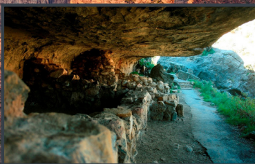
Wupatki National Monument